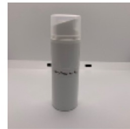
Cannabinoids (% weight)